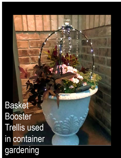
Basket Booster Trellis used in container gardening

The LED lights consist of 4 strands, each strand is 28 inches long and extends from a central solar panel that has a AA battery backup. (The battery is not included). Each strand of LED lights are wrapped around each of the trellis strands by the Grower after the trellis is assembled or the Gardener may purchase the lights separately as an add-on.