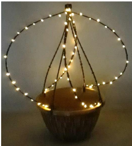
Assembled Into the Swirl shaped trellis