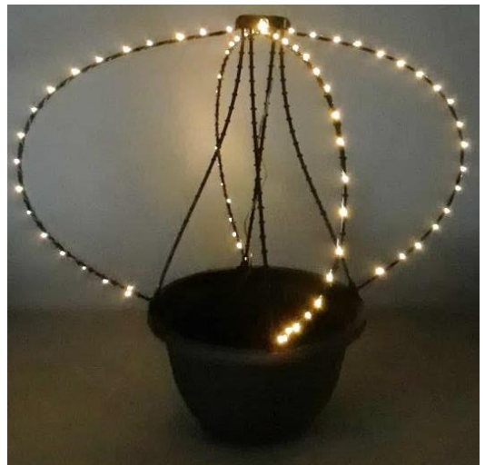
Assembled Into the Orb shaped trellis